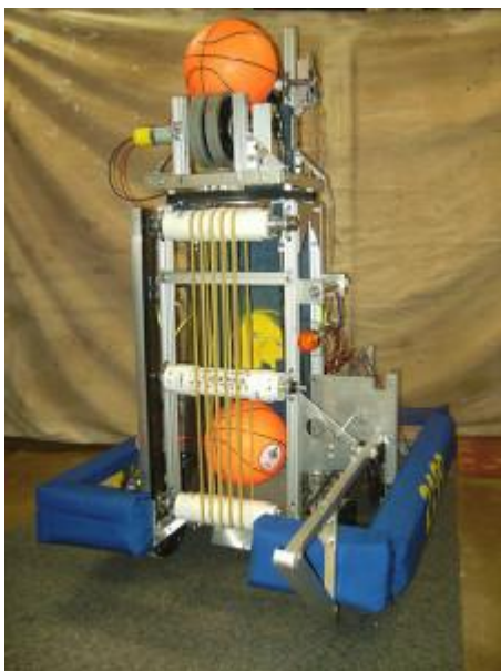
The Robo Lions' 2012 FRC robot!

Presentation: The Robo-Lions, FIRST Robotics Competition team number 2199, are based at Liberty High School in Eldersburg, Maryland. Our goal is to inspire young people into entering careers related to science, technology, engineering, and math (STEM). To accomplish this goal, the team competes in the FIRST (For Inspiration and Recognition of Science and Technology) Robotics Competition, a competition designed to deliver hands-on STEM experience to high school students. While they started out as a humble little club in 2006, the Robo-Lions have evolved to become one of Liberty High Schools largest after-