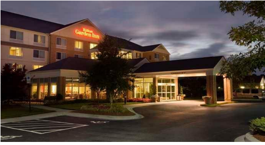
Hilton Garden Inn, Columbia Maryland

On December 14th, the Chesapeake Chapter held its annual Holiday Party and Awards Banquet at the Hilton Garden Inn in Columbia, MD. Chapter members and their guests enjoyed each other's company and a tasty buffet during a relaxing evening.