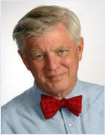
Dr. Richard de Neufville

Flexibility in design is an idea whose time has come. Experience indicates that the use of flexible design for the design of major infrastructure systems can lead to significant, double digit percent improvements in expected value. Computational and methodological advances now enable us to investigate the performance of designs under multiple scenarios, and to identify those that can perform best over the range of possible eventualities.