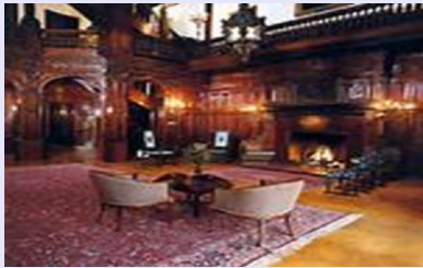
The Engineer's Club

It's been a wonderful year of meals, lectures and fellowship. Come celebrate with us as we recognize those who have helped us realize INCOSE's mission to push SE out into the front of the public debate.