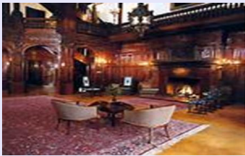
The Engineer's Club

It's been a wonderful year of lectures, fellowship, and meals. Come celebrate our 20th anniversary as we recognize those who have helped us realize INCOSE's mission to push SE out into the front of the public debate. Join us for an evening of fine food and stimulating conversation with friends and colleagues including the