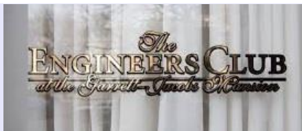
The Engineer's Club