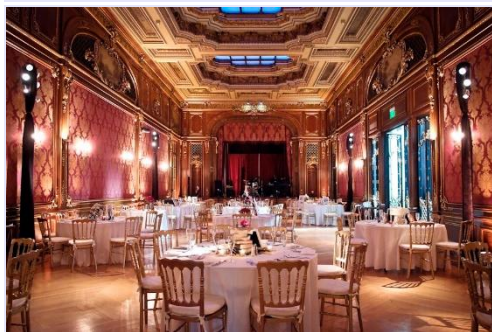
The Engineer's Club

It's been a wonderful year of meals, lectures and fellowship. Come celebrate our 20th anniversary as we recognize those who have helped us realize INCOSE' mission to push SE out into the front of the public debate. Join us for an evening of fine food and stimulating conversation with friends and colleagues including the presentation of the System Engineer Of the Year Award.